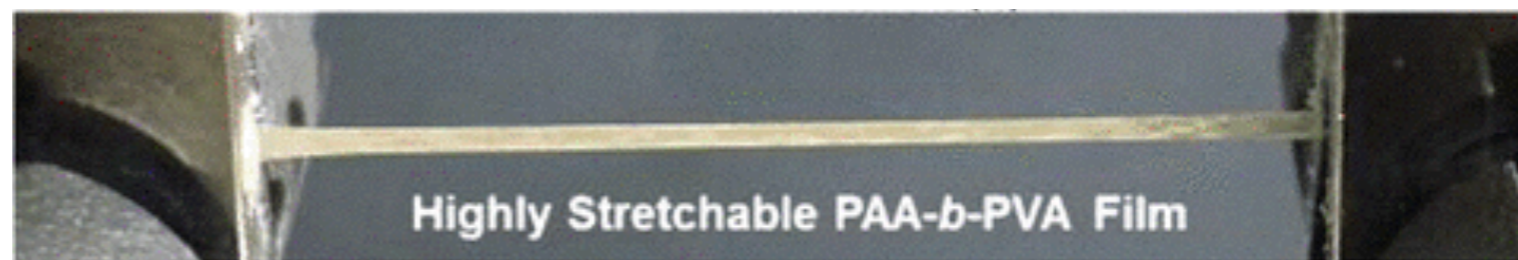
Highly Stretchable PAA-b-PVA Film